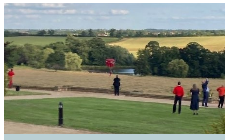
Beating Retreat. Waiting for the Red Devils to appear.

It was the most perfect summer's evening for Beating Retreat at DMRC Stanford Hall and the Red Devils made a spectacular entrance, unfurling their Union Jack with precision timing.