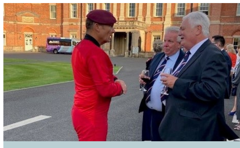
Beating Retreat Stanford Hall with Provincial Grand Master Bedfordshire, and a Red Devil.