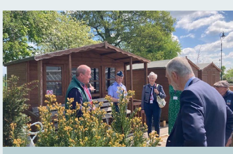
Headley Court Charity Trustees visit Stanford Hall.