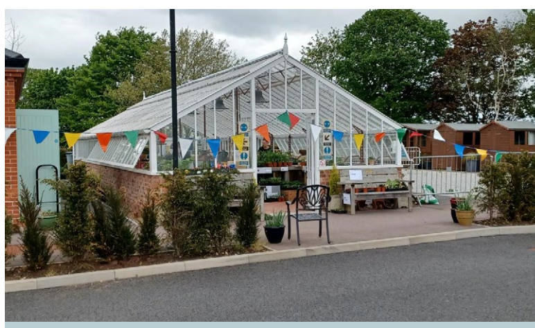
First Farm Shop of 2021.