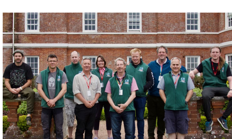
End of course photo in front of Bicton. REW01.