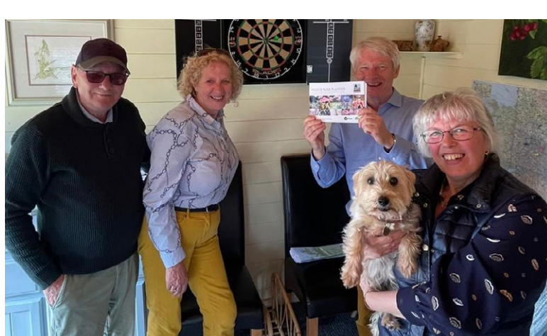
Vitax and their Bulb Planner.